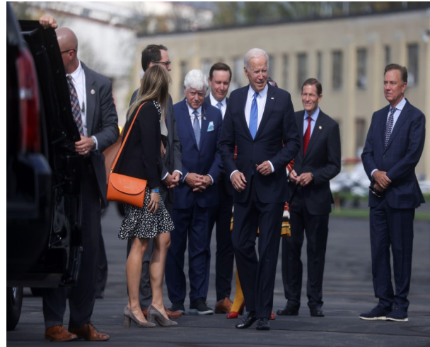
President Joe Biden is greeted upon arrival aboard Marine One at Brainard Airport in Hartford on Oct. 15, 2021.

Hartford Courant Editorial February 6, 2022